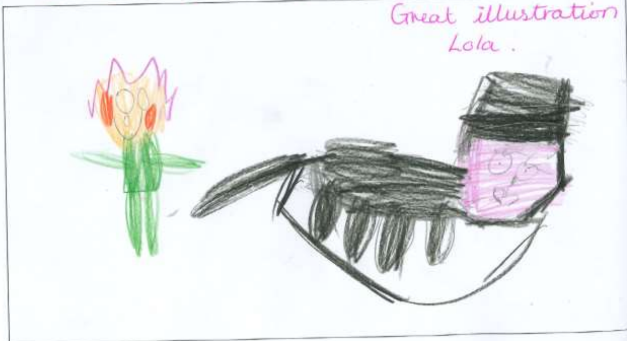
Great illustration Lola.

but look me up and down I'm the smartest giant in town. CHALLENGE! Draw an illustration for your part of the story.