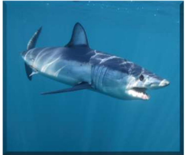
Pictured: The world's fastest shark, the shortfin mako

begins tomorrow.' Sometimes known as the 'cheetah of the ocean', the shortfin mako shark can reach speeds of about 45mph!