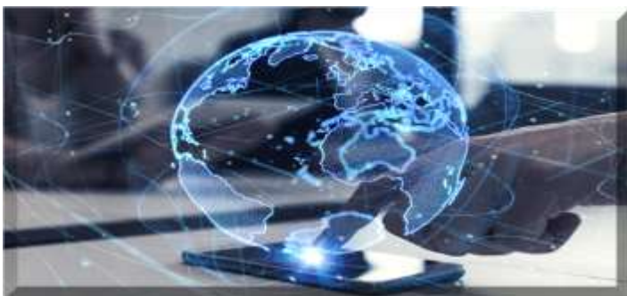
Pictured: Using broadband to connect to the world

How many of us rely on broadband in our everyday lives? Perhaps you might use it in school as part of lessons or to access learning at home? Perhaps your family food shop is done online, a family member works from home, or you use it to play games? Broadband is a high-speed internet connection that uses multiple types of technology